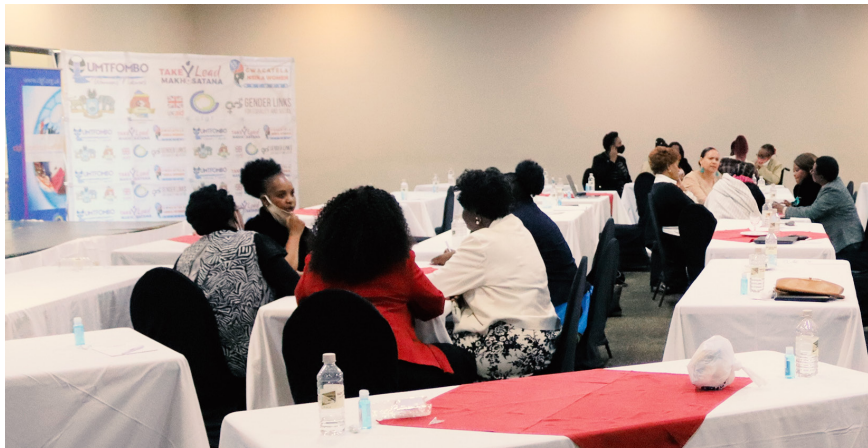
Women in Local Government Forum, Eswatini: strategic development