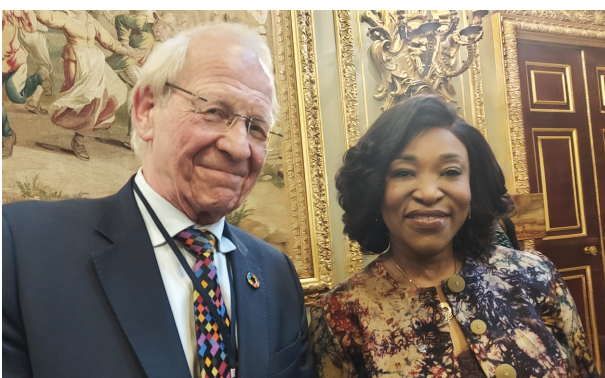
The author pictured with Commonwealth Secretary-General Shirely Botchwey